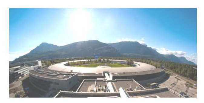
Figure 1. View of the ESRF synchrotron from above.

Starting from year 2004, Poland is an Associated Member of the European Synchrotron Radiation Facility (ESRF) in Grenoble, France. In the period from 2004-2006 with the contribution at the level of 0.6% of ESRF budget and in the period 2006-2011 at the level of 1%. Starting from October 2011 there was no a legal path to apply for paying the Polish contribution. Nevertheless, Polish government has declared that is working on solving this problem and the necessary changes in the low will be made but any agreement between Poland and ESRF was signed. In the absence of a valid agreement, securing the necessary funding was no longer possible. However, activities for the establishment of a new legal and financial mechanism enabling the renewal of the long-term arrangement have been actively ongoing since 2011. Moreover, the Polish October scientific community has continued to successfully use the ESRF at the same level as before and Polish post-docs and PhD students have continued to be welcomed in the ESRF staff complement, despite the fact that no formal arrangement has been in force between the Parties since October 2011 and that IF PAN (as representative of Poland) has not made any financial contribution to the ESRF during this period.